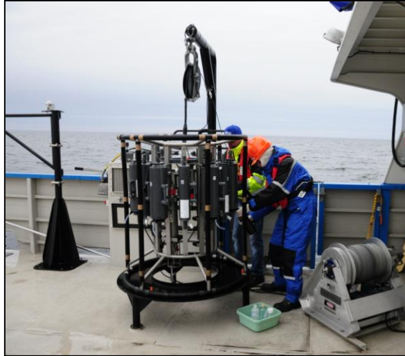
Fig. 2 Probe CTD 90

Water sampling system “Hydro - Bios” PRS 12, Sea & Sun probe CTD 90, automatic meteorological station MAWS 420, Seccki disk, filtrating equipment and integrated samples sampler “Hydro-Bios” were used during the cruise.